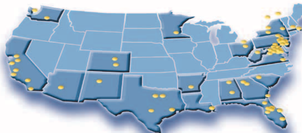
Great places to live and work.