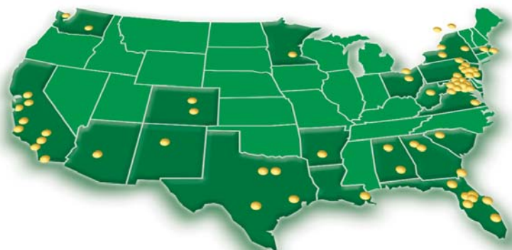
Lockheed Martin customer sites include numerous other locations in addition to those noted here.